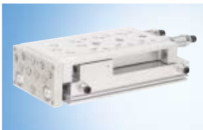
A large number of mounting holes ensure flexibility

5 piston diameters (sizes) from 8-25 mm with standard stroke lengths from 10 to 200 mm and a recommended load-bearing capacity of up to 6 kg.