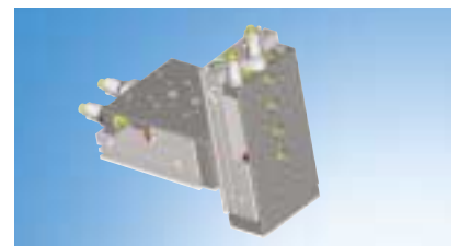
The slides can be mounted in combination without adapter plates onto the larger of the MSC units. This can be done for multi-axis pick & place systems, for example.