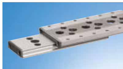
The heart of the MSC mini slide is a wide guide rail with an integrated precision ball bearing guide